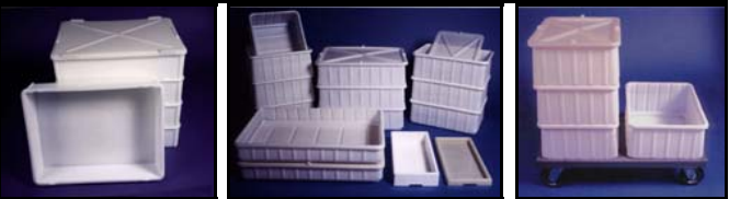
Self Stacking Bins & Boxes Seal without Lids