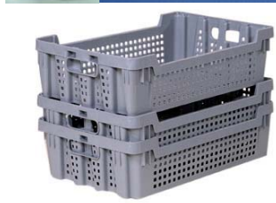
Stack and Nest, Sheet Pans, Nesting Trays