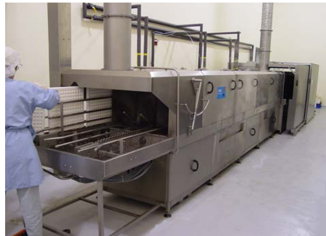
MAFO "Seamless" Tunnel Washing Machines