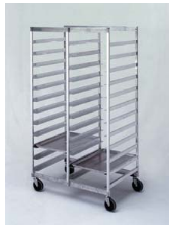
Custom & Standard Racks, Carts, Dollies & Casters