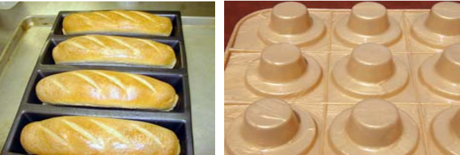
Shape2BAKE Series - Ovenable Teflon Moulds Flexible, non-stick, baking/freezing products