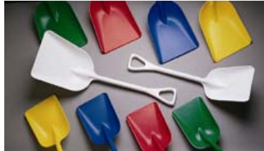
DS Series - 5-color scrapers, paddles & shovels